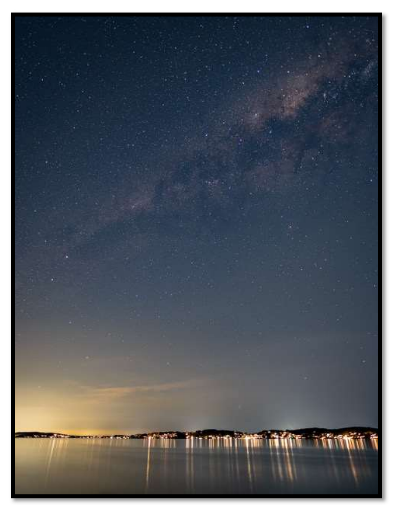
Looking south from Green Point – Annette Collins