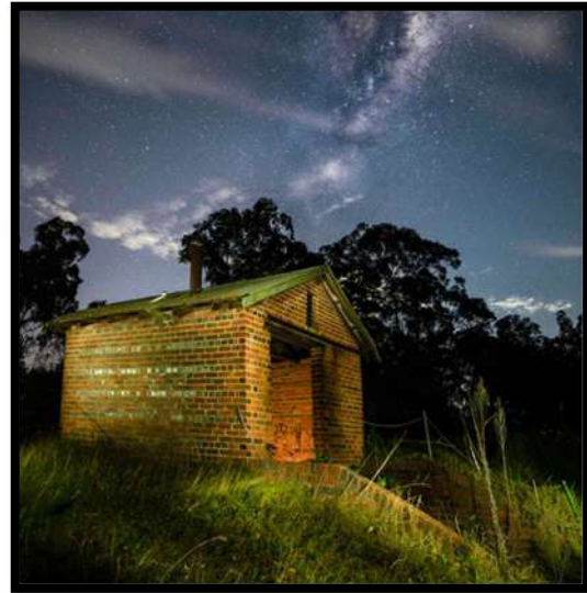
Image 4 shows an old boiler house that we lit using torches and even used a small LED panel to light up the interior.

Revisit that location and composition at the required date, Hope for not too many clouds in the sky ie a clear night and capture my composition as planned. In capturing the image, you need to take an image that has the stars in focus followed by a series of images where you use a small torch to light your foreground interest. You then use Photoshop to combine all your images together to produce your completed Nightscape image.