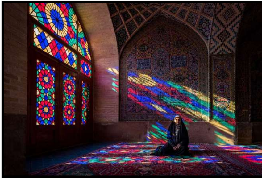
The architecture of the mosques was stunning.