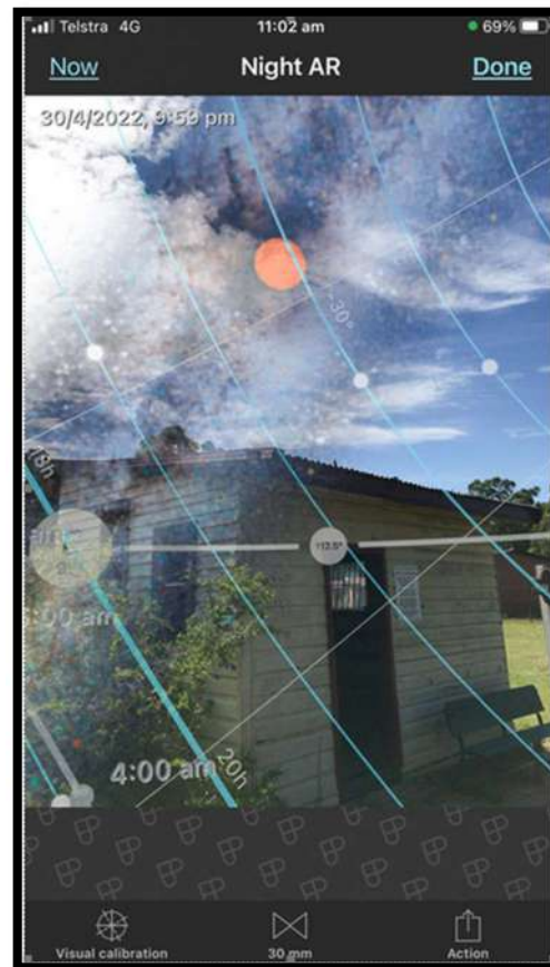
I use PhotoPills augmented reality to determine where and when the Milkyway core will be in my image for that location. You can see here that in late April at approximately 10pm the core of the milky way will be in the night sky above the railway station. I take a screen shot and save the time and location into PhotoPills to use as a reference for future images. The stars will always be in that location at that time and date into the future