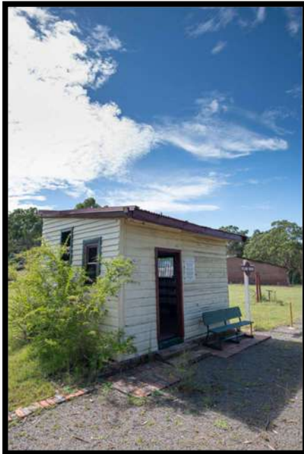
I try and visit the site during daylight hours with my camera to try and search out possible compositions. Here you see the old Pelaw Main railway station that I thought would be an ideal candidate.